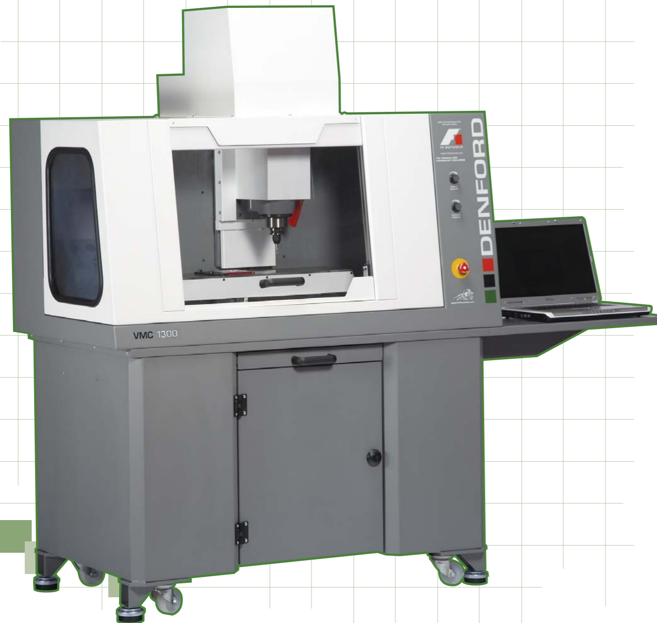
Shown with optional universal bench and optional computer support extension. (PC not included)