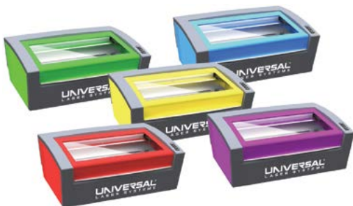
Side panel colour variations

For LaserCAM 2D Design Software see pages 38 - 39