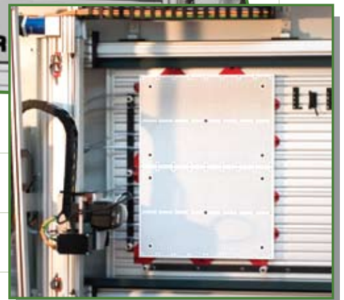
Large Format Vacuum Bed See Router Accessories page 35.