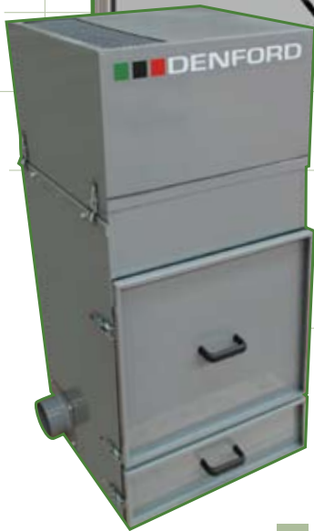
High volume, floor standing dust extraction unit