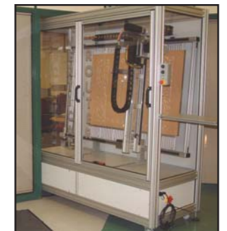
Will fit through a standard door