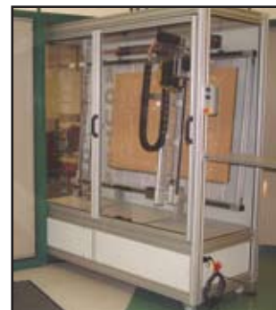
Will fit through a standard door