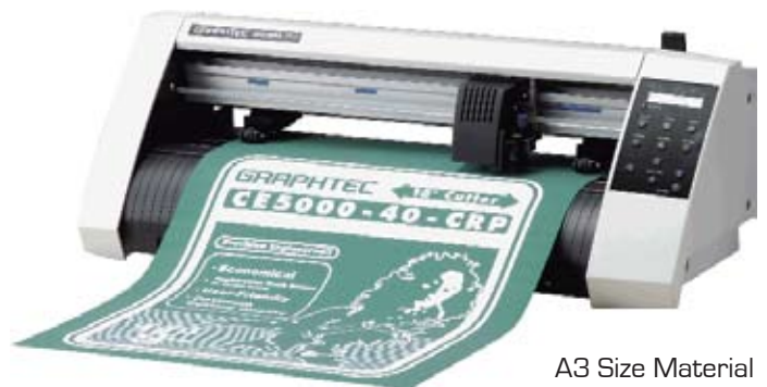
A3 Size Material