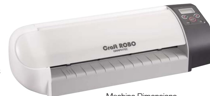
Machine Dimensions 420mm x 140mm x 112mm.

An ideal entry level introduction to CAD/CAM, the Craft ROBO is a compact cutter/plotter that uses standard A4 size material. It is very simple to use and comes complete with wizard based design software and auto registration marker. Designs can be drawn using a standard ballpoint pen in the machine, and the supplied cutter heads allow the cutting or scoring of vinyl and card including pre-printed designs to produce imaginative artefacts and models.