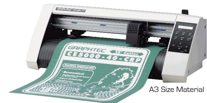
A3 Size Material