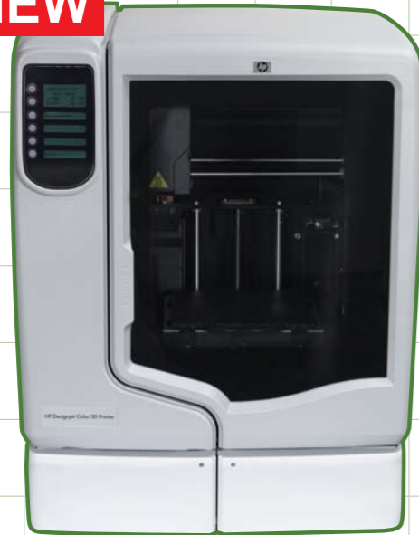
HP Designjet 3D Printer