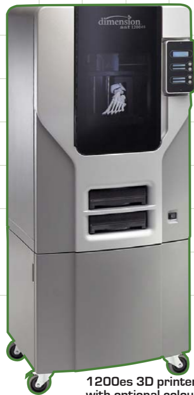
1200es 3D printer shown with optional colour-matched stand.