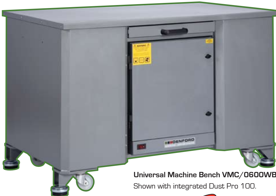
Universal Machine Bench VMC/0600WB

Weight: 103kg (with integrated dust extraction unit 163kg)