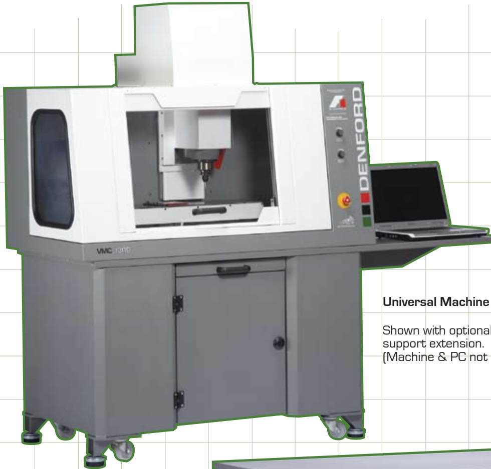
Universal Machine Bench VMC/0600B

Shown with optional computer support extension. (Machine & PC not included)