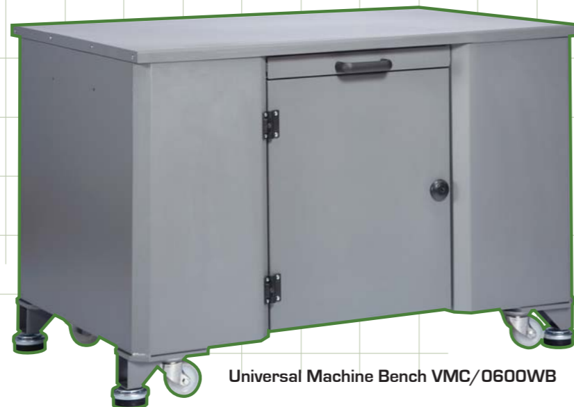
Universal Machine Bench VMC/0600WB

Shown with optional computer support extension. (Machine & PC not included)