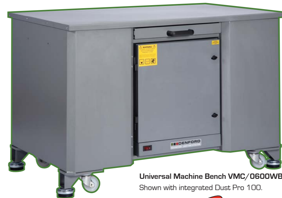
Universal Machine Bench VMC/0600WB

Weight: 103kg (with integrated dust extraction unit 163kg)