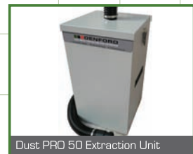
Dust PRO 50 Extraction Unit

Optional accessories include the Denford Universal Machine Bench (shown above), which allows full portability and plenty of storage space.