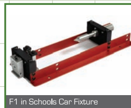
F1 in Schools Car Fixture