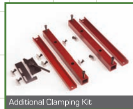
Additional Clamping Kit