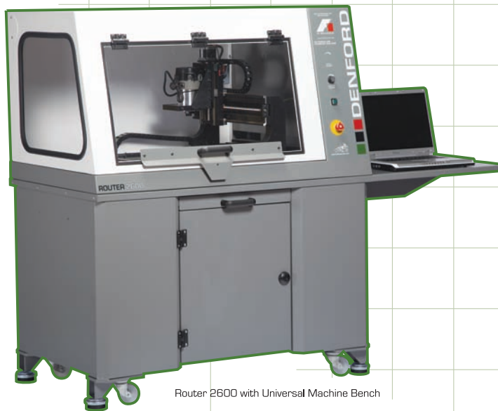
Router 2600 with Universal Machine Bench

The Denford Compact 1000 and Router 2600 are built to the very best traditions of British Manufacturing. These high speed machines are suitable for use with a broad range of resistant materials; and, in addition, the Compact 1000 Pro and Router 2600 Pro models have the capacity to cut non-ferrous metals. These machines come with a full 3 Year Parts and Labour Warranty.